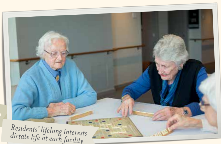
Residents’ lifelong interests dictate life at each facility

“I’m very much looking forward to seeing the Eden story’s next chapter unfold with Mercy Health. It’s such a privilege to be able to create positive change for our community’s elders.”